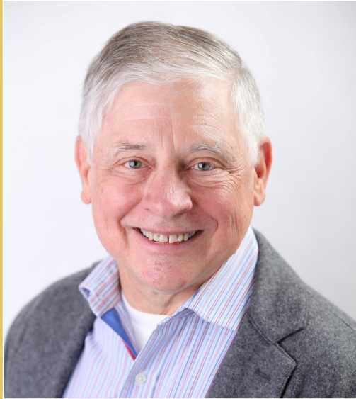
Bright Falcon USA • Greater Carolinas