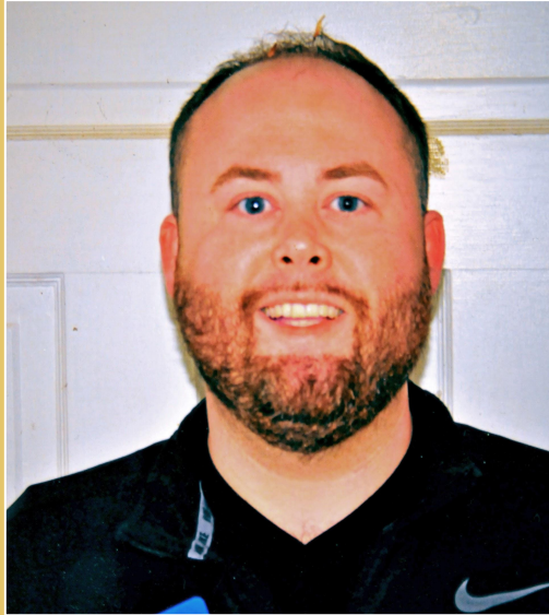
Slaying Mantis USA • Mid America, Kentucky