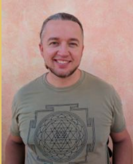
Grief Walker Ontario • Canada