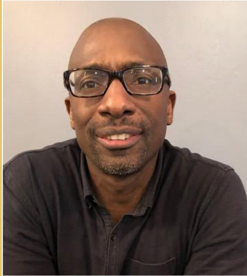
Sacred Little Light USA • New England