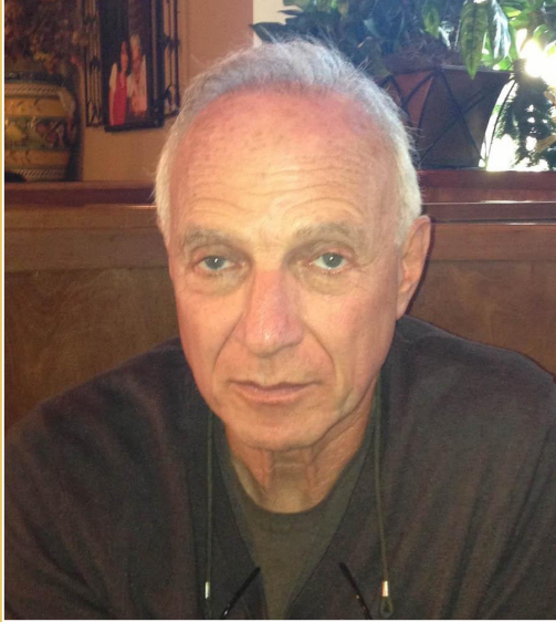
Crazy Hawk USA • South Central