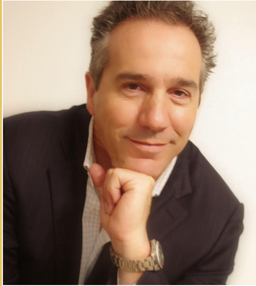
Redwood Whispering Peace USA • Northern California