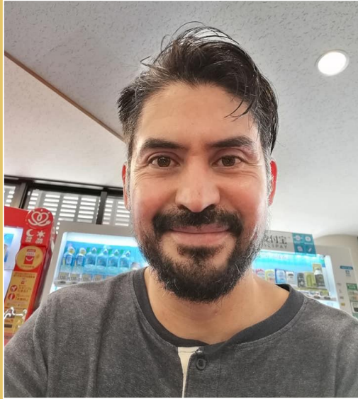
Serpiente Guerrero México • México City