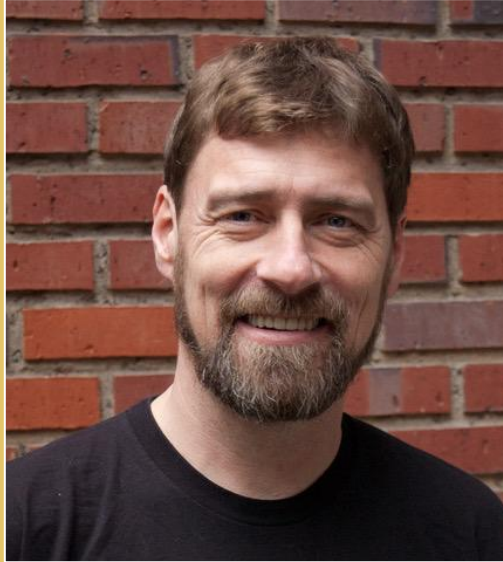
Scrubjay USA • Northwest