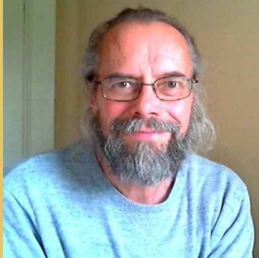
Gliding Blue Heron MKP UK & Ireland