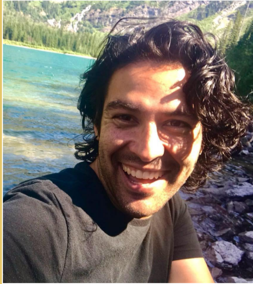
Mariposa USA • Southern California