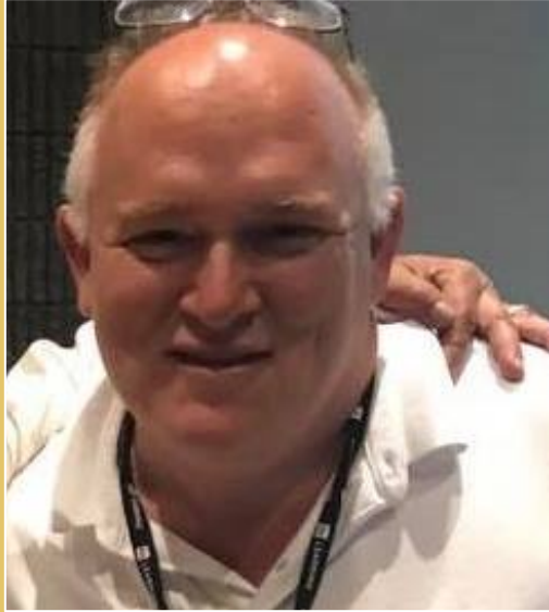
Powerful Tern with Jonathan Livingston Seagull USA • Mid America, Indiana