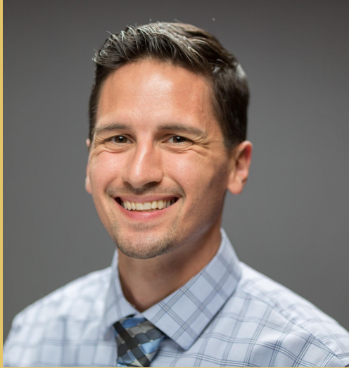
Strong Fox King USA • South West