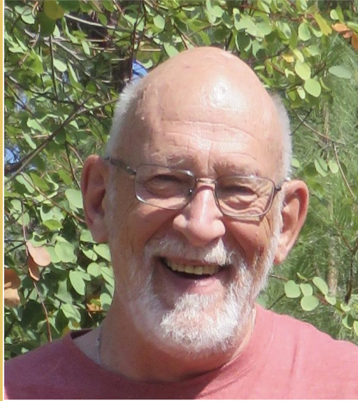
Hummingbird with Raven Heart Canada • British Columbia