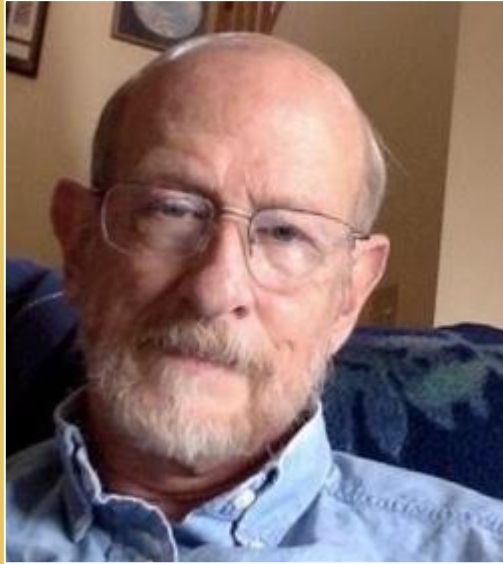
Comforting Polar Bear USA • Mid Atlantic