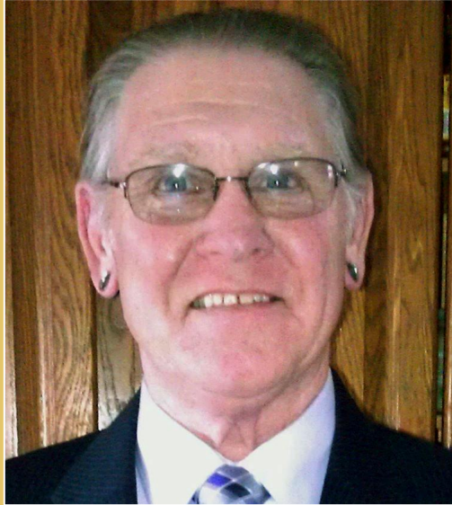
Turkey Vulture USA • Upstate New York