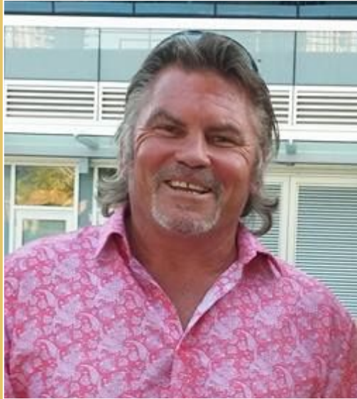
Shining Owl with Sacred Heart USA • San Diego