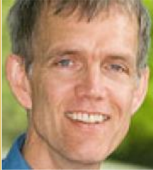
Gliding Caribou USA • Southeast