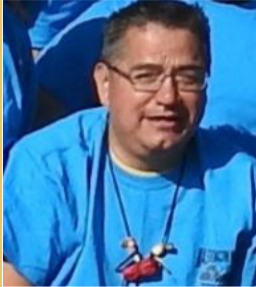
2 Bright Shadows Canada • Alberta