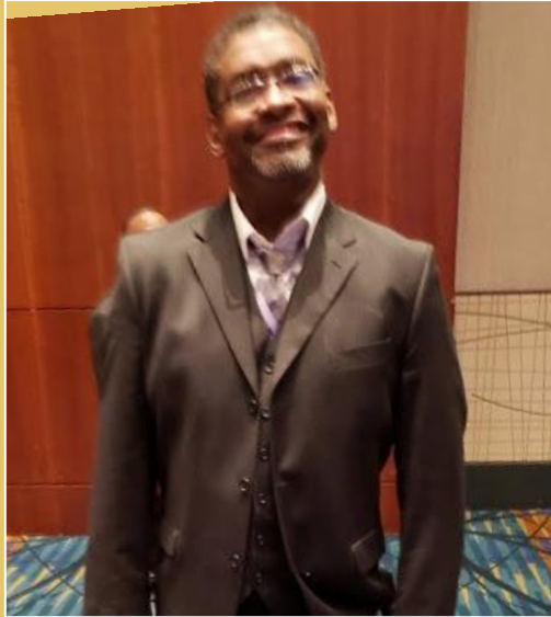
Warrior Dove with Fierce Open Heart & Wild Black Panther USA • Mid Atlantic