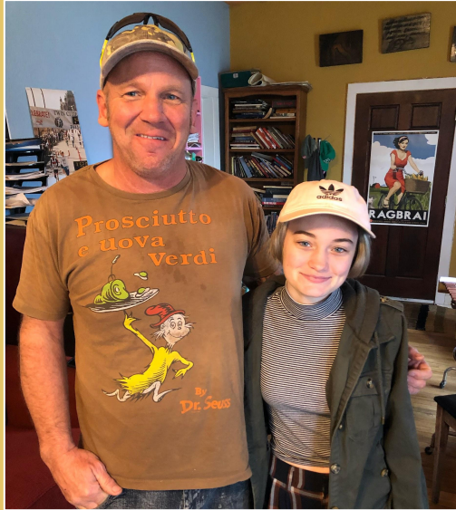
Gliding Blue Heron USA • Central Plains