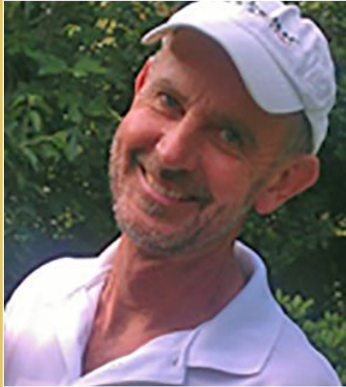
Strong Black Dog USA • Colorado