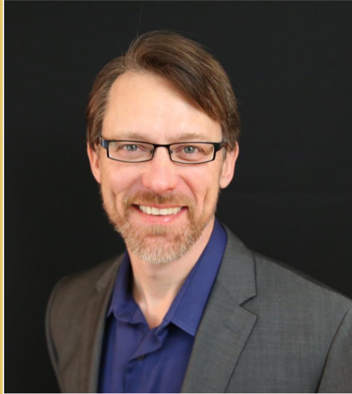
Courageous Wild Tree Fox USA • Heartland